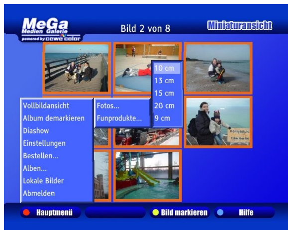
Figure 2: Ordering prints from TV

With the advent of digital cameras, billions of digital photos are shot. So far, the photo-finisher CeWe Color provides a Home Photo Service [2] for their customers to order prints and other physical goods of their digital photos online and have them delivered either by regular mail or to a photo shop near by. With our Media Gallery, this application moves towards digital TV, opening a new distribution channel and market opportunity for sharing and printing digital photos. Using the Media Gallery, a user can view digital photos that have been uploaded to a Web album or copied directly from a digital camera onto the user's set-top box. The Media Gallery allows to browse through the different albums, viewing them as thumbnails, in full screen images as well as in user defined slideshow. Figure 2 depicts a screenshot of the Media Gallery, showing the thumbnail view. In this view, a user can select pictures of an album for ordering prints.